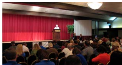
View from the audience.

In September 2006, the Kentucky Society hosted the 18th Annual Professional Development Conference of the American Academy of Certified Public Managers in Louisville at the Galt House. This event marked the 10-year anniversary from the last time that Kentucky was host. It was also the 30 th anniversary of the establishment of the Certified Public Manager program.