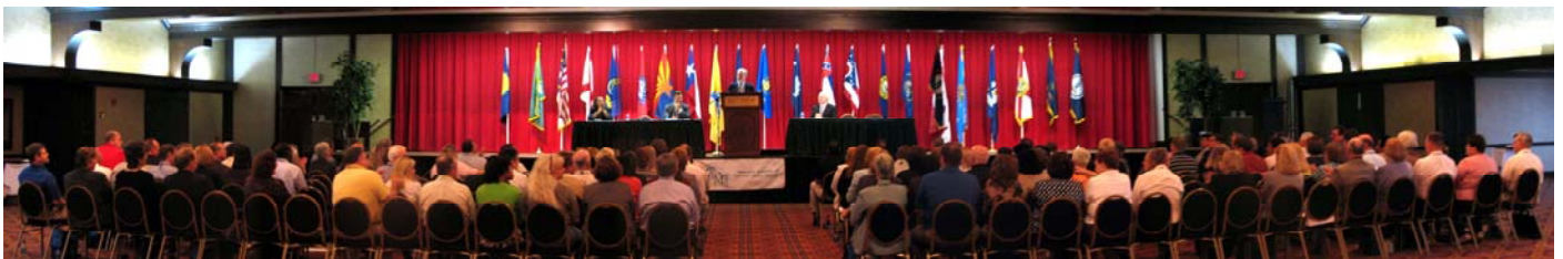
Photo from American Academy of Certified Public Managers® 18th Annual Professional Development Conference in downtown Louisville, Kentucky.

The mission of the Kentucky Society of Certified Public Managers is to establish, promote, enhance, and recognize the management profession through comprehensive training, networking, professional growth, and ethical standards of behavior; to promote service consistent with efficient and effective management practices; and to demonstrate vision and competence in professional management.