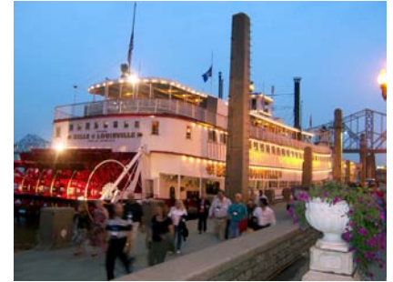
Belle of Louisville excursion.

View the related PowerPoint presentation at: http://www.cpmacademy.org/default.htm