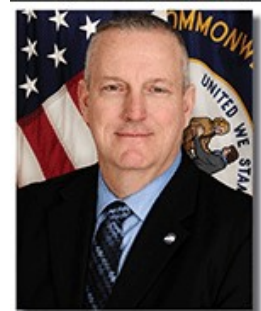
Organization is a Team - Theme of Summer Luncheon