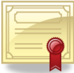
KCPM Graduation December 10, 2009