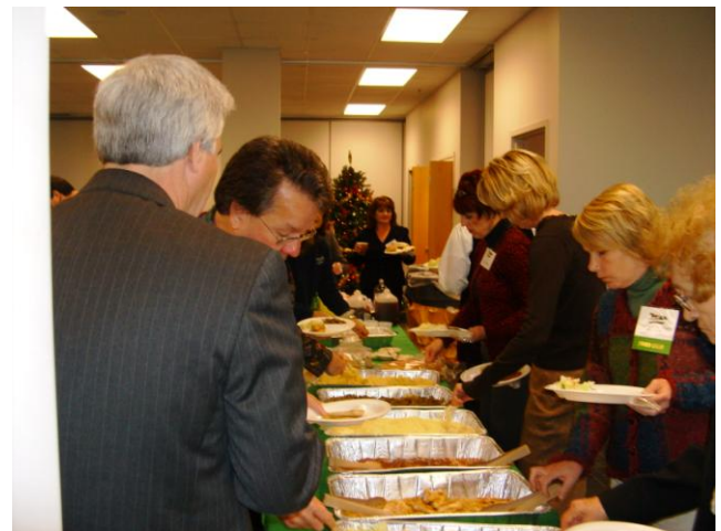
Members enjoy lunch