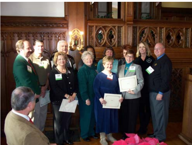
2010 KSCPM Officers and Board