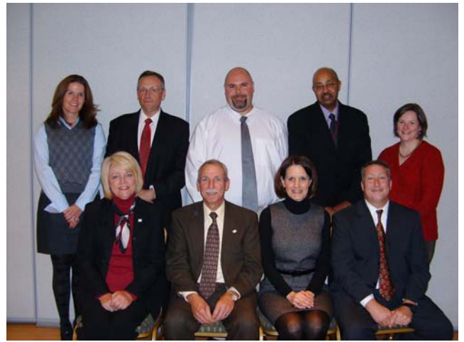
KSCPM members receiving CPM certification