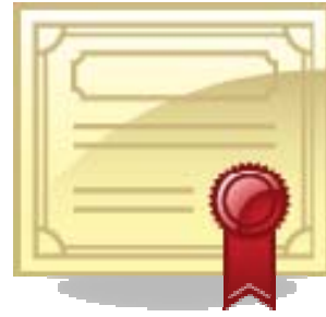
KCPM Graduation November 4, 2010