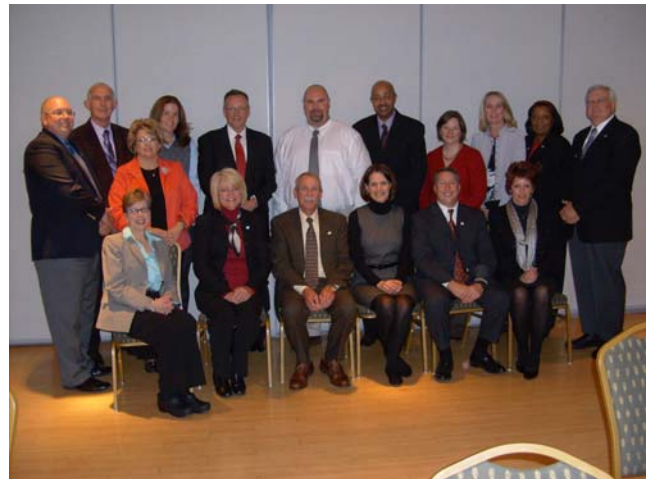
KSCPM Members celebrate members receiving CPM certification