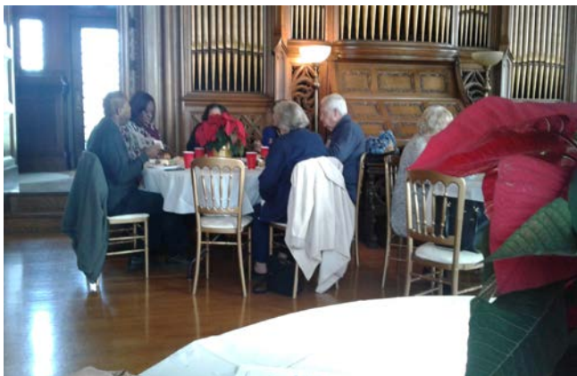
Members and Guests at the Election and Awards Luncheon