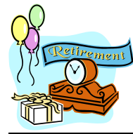
Will you be retiring?