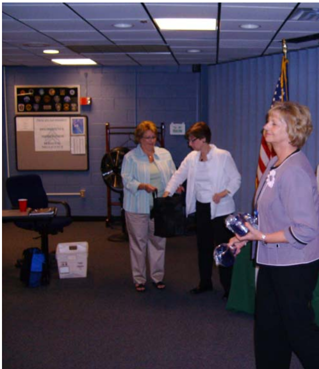
Door Prize Drawings