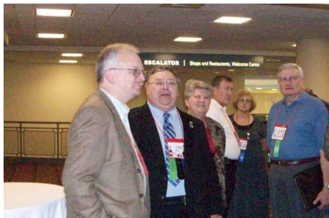
AACPM Past Presidents