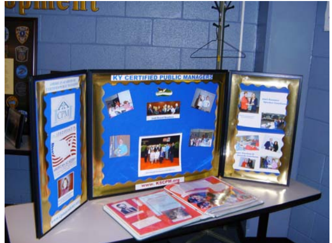
KSCPM Display & Historical Scrapbook