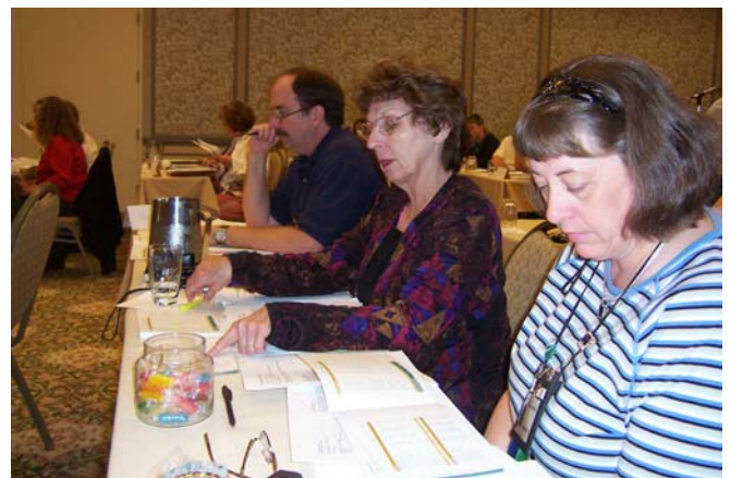
KSCPM Delegates at HOD

Thank-you all for making the conference such a positive experience for this "rookie". I hope to see you all next year in OH io!