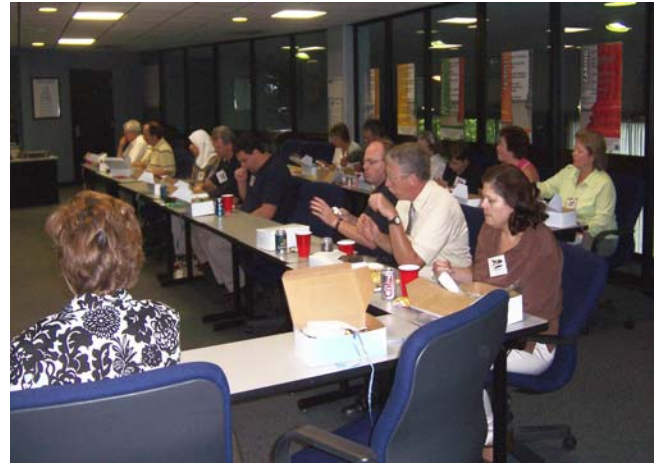
Luncheon attendees enjoy box lunches

The next speaker luncheon will be held in October in Frankfort. Watch for the e-mail announcement!