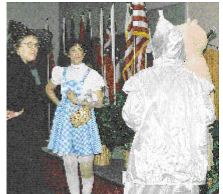
Gearing up for 2004 in Kansas

"The aim of an argument or of a discussion should not be victory but progress."