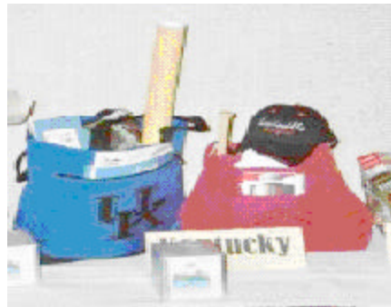
Kentucky Raffle Offerings