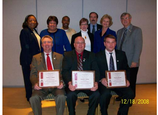
Kentucky Society of Certified Public Managers®