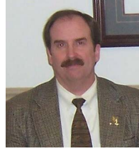
2007 Gene W. Childress Leadership Award